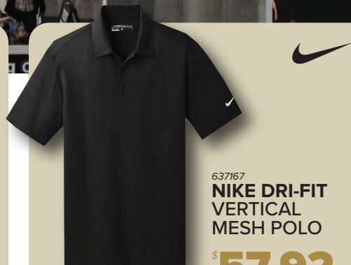
637167 NIKE DRI-FIT VERTICAL MESH POLO

*additional embroidery charges will apply