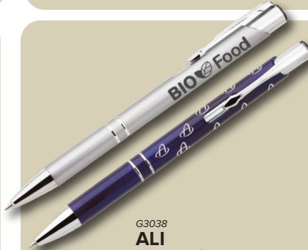
G3038 ALI BALLPOINT PEN

*additional decoration charges will apply