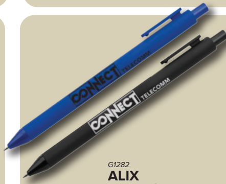
G1282 ALIX BALLPOINT PEN

*additional decoration charges will apply