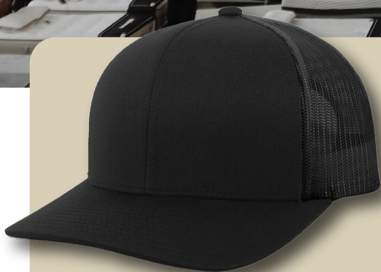
BAL-104C TRUCKER SNAPBACK CAP