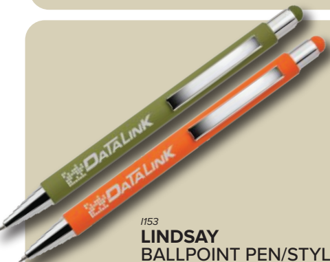
I153 LINDSAY BALLPOINT PEN/STYLUS

*additional decoration charges will apply