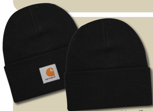
A18 CARHARTT ACRYLIC CUFF TOQUE $ 26.36 ea minimum 12 pcs

*additional embroidery charges will apply