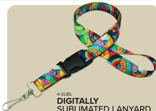
4-SUBL DIGITALLY SUBLIMATED LANYARD

*additional decoration charges will apply